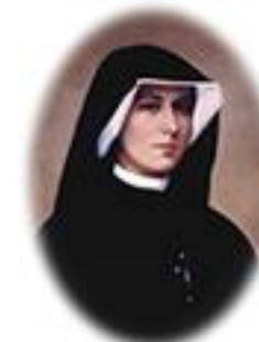
Saint Maria Faustina