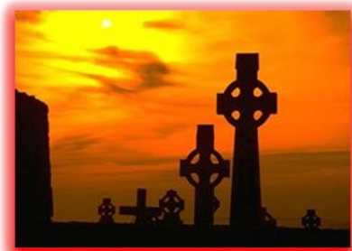
All Souls' Church Bridgeport, NE 69336