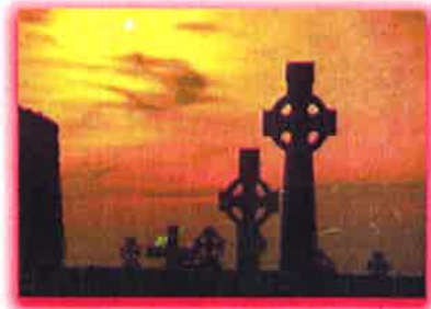
All Souls' Church Bridgeport, NE 69336