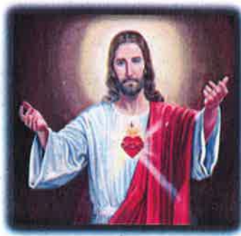
Sacred Heart Church Bayard, NE 69334