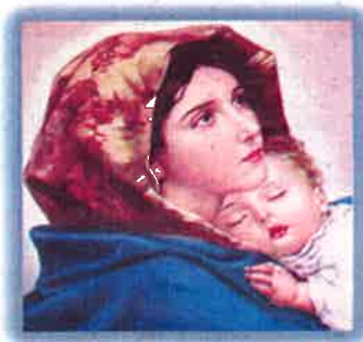
St. Mary's Church Dalton, NE 69131