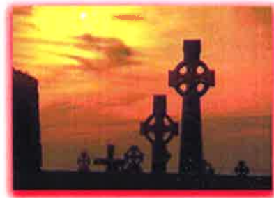
All Souls' Church Bridgeport, NE 69336