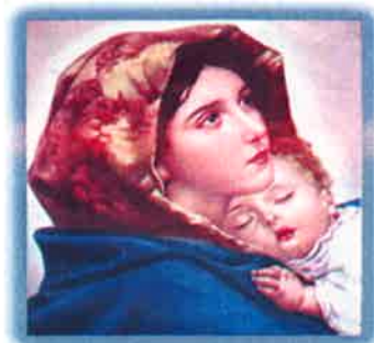
St. Mary's Church Dalton, NE 69131