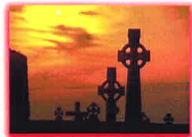
All Souls' Church Bridgeport, NE 69336