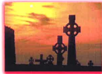
All Souls' Church Bridgeport, NE 69336