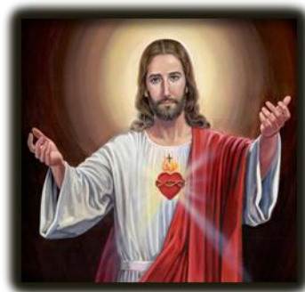
Sacred Heart Church Bayard, NE 69334

Parish Office & Fax: (308)262-0709. Rectory: (308)262-1332 Email: allsoulsbridgeport@gmail.com Website: www.smassh Catholics.org