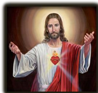
Sacred Heart Church Bayard, NE 69334

Parish Office & Fax: (308)262-0709. Rectory: (308)262-1332 Email: allsoulsbridgeport@gmail.com Website: www.smassh Catholics.org