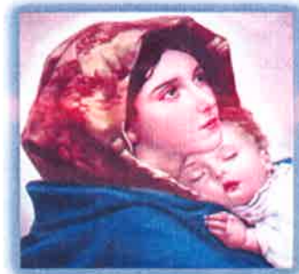
St. Mary's Church Dalton, NE 69131