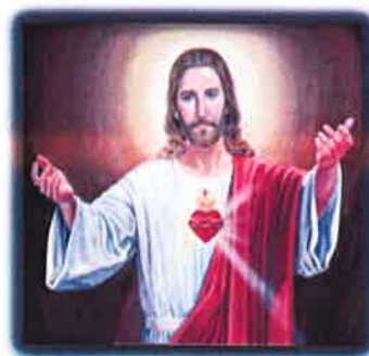
Sacred Heart Church Bayard, NE 69334