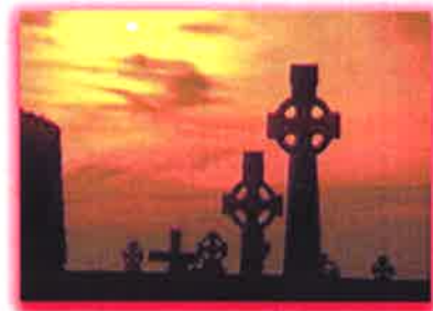
All Souls' Church Bridgeport, NE 69336