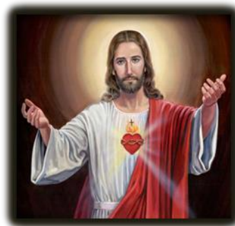
Sacred Heart Church Bayard, NE 69334

Parish Office & Fax: (308)262-0709. Rectory: (308)262-1332 Email: allsoulsbridgeport@gmail.com Website: www.smassh Catholics.org