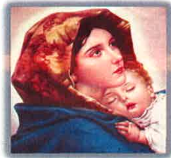
St. Mary's Church Dalton, NE 69131