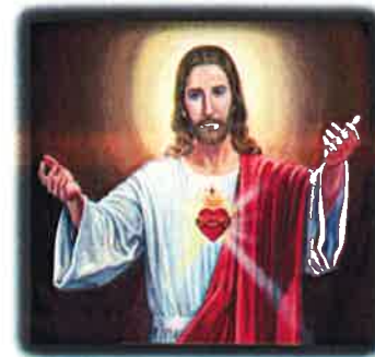
Sacred Heart Church Bayard, NE 69334