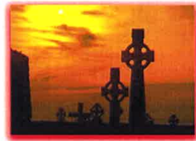
All Souls' Church Bridgeport, NE 69336