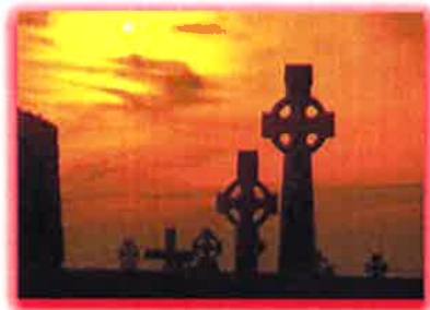
All Souls' Church Bridgeport, NE 69336