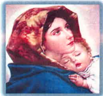
St. Mary's Church Dalton, NE 69131