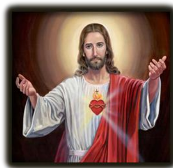
Sacred Heart Church Bayard, NE 69334

Parish Office & Fax: (308)262-0709. Rectory: (308)262-1332 Email: allsoulsbridgeport@gmail.com Website: www.smassh Catholics.org