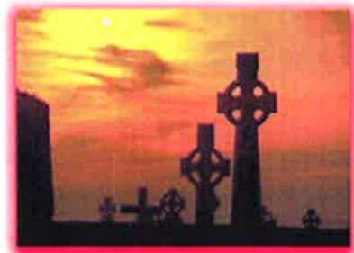
All Souls' Church Bridgeport, NE 69336