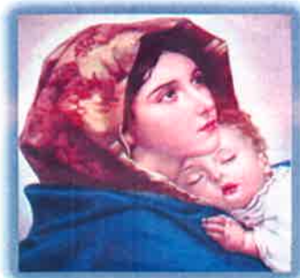
St. Mary's Church Dalton, NE 69131