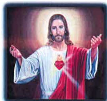
Sacred Heart Church Bayard, NE 69334