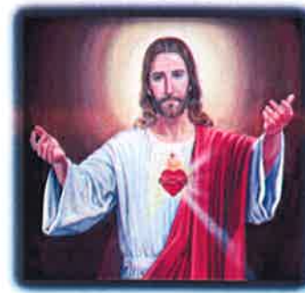
Sacred Heart Church Bayard, NE 69334

Parish Office & Fax: (308)262-0709. Rectory: (308)262-1332 Email: allsoulsbridgeport@gmail.com Website: www.smassh Catholics.org