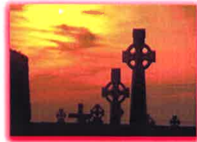
All Souls' Church Bridgeport, NE 69336