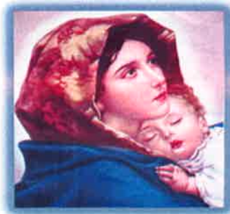
St. Mary's Church Dalton, NE 69131