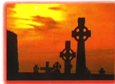
All Souls' Church Bridgeport, NE 69336