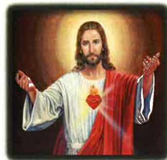
Sacred Heart Church Bayard, NE 69334