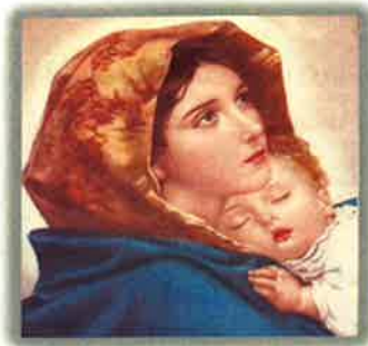
St. Mary's Church Dalton, NE 69131