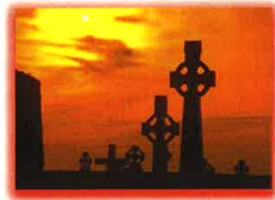
All Souls' Church Bridgeport, NE 69336