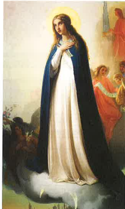
THE ASSUMPTION OF THE VIRGIN MARY, PAVIA CATHEDRAL

From Catholic and Cornered: Answers to Common Questions About Your Faith , © 2011 Liguori Publications