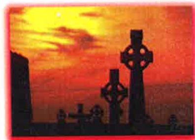
All Souls' Church Bridgeport, NE 69336