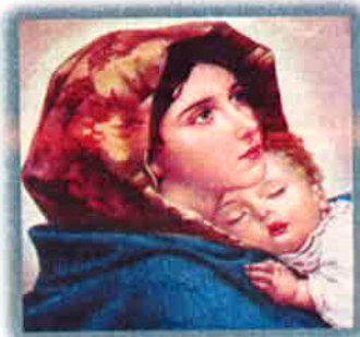
St. Mary's Church Dalton, NE 69131