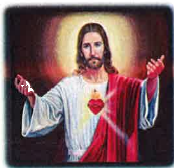
Sacred Heart Church Bayard, NE 69334