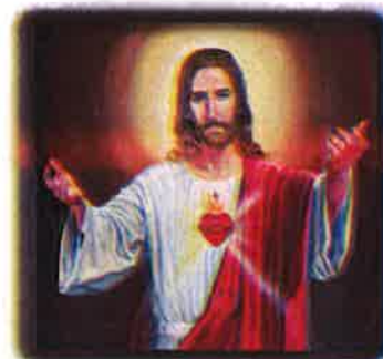
Sacred Heart Church Bayard, NE 69334