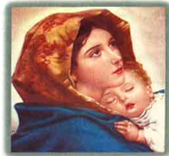
St. Mary's Church Dalton, NE 69131