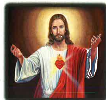
Sacred Heart Church Bayard, NE 69334