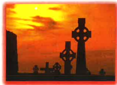
All Souls' Church Bridgeport, NE 69336