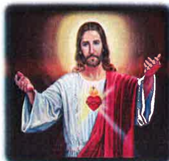
Sacred Heart Church Bayard, NE 69334