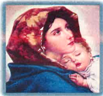
St. Mary's Church Dalton, NE 69131