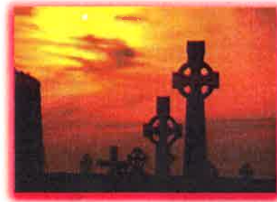
All Souls' Church Bridgeport, NE 69336