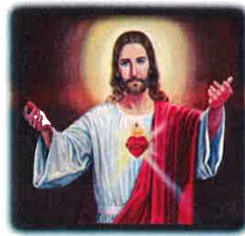
Sacred Heart Church Bayard, NE 69334