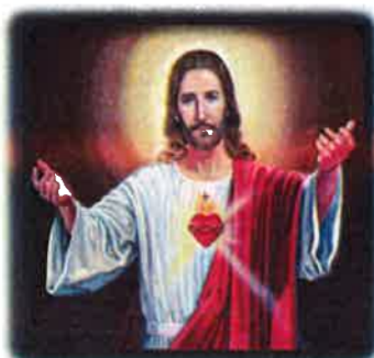
Sacred Heart Church Bayard, NE 69334

Parish Office & Fax: (308)262-0709. Rectory: (308)262-1332 Email: allsoulsbridgeport@gmail.com Website: www.smassh Catholics.org