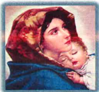
St. Mary's Church Dalton, NE 69131