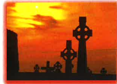
All Souls' Church Bridgeport, NE 69336