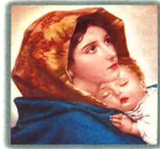
St. Mary's Church Dalton, NE 69131