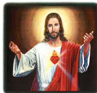
Sacred Heart Church Bayard, NE 69334

Address: 701 P Street, Bridgeport, NE 69336