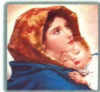
St. Mary's Church Dalton, NE 69131