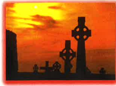
All Souls' Church Bridgeport, NE 69336