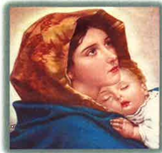
St. Mary's Church Dalton, NE 69131