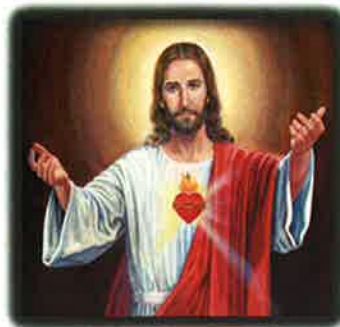
Sacred Heart Church Bayard, NE 69334