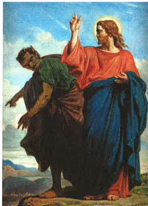
THE TEMPTATION OF CHRIST BY THE DEVIL, BY FELIX JOSEPH BARRIAS, 1860

However, unlike the change in the Italian Lord's Prayer that will appear in their third edition of The Roman Missal , no immediate plans have been made to change the wording in English-speaking countries.