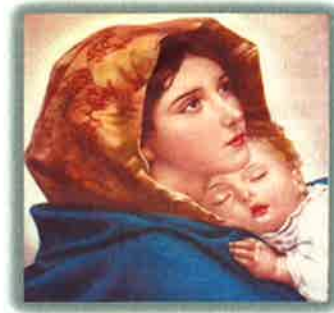
St. Mary's Church Dalton, NE 69131