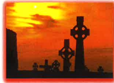
All Souls' Church Bridgeport, NE 69336