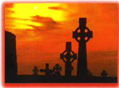
All Souls' Church Bridgeport, NE 69336