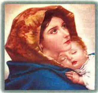
St. Mary's Church Dalton, NE 69131