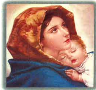
St. Mary's Church Dalton, NE 69131