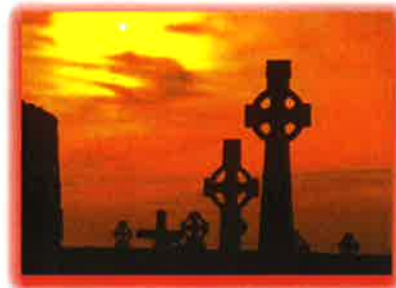
All Souls' Church Bridgeport, NE 69336