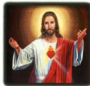
Sacred Heart Church Bayard, NE 69334

Mailing Address: 701 P Street, Bridgeport, NE 69336