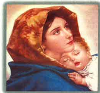
St. Mary's Church Dalton, NE 69131